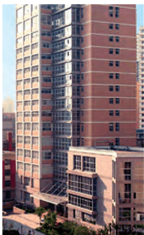
Shanghai Institute of Ceramics Chinese Academy of Science building

After the Olympics, after an earthquake, after the launch of the Shenzhou 7 spacecraft (with its ceramic composite rocket engines) and its taikonauts' space walk, and after seeing skylines like the ultramodern Pu Dong section of Shanghai (above) – no one can claim to be surprised by China being an enormous world player in all things scientific, industrial, cultural and, yes, ceramic.