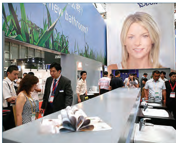
China-made sanitaryware sales continue to grow but face escalating manufacturing costs.

One example of the Chinese cement industry is the Tangshan Jidong