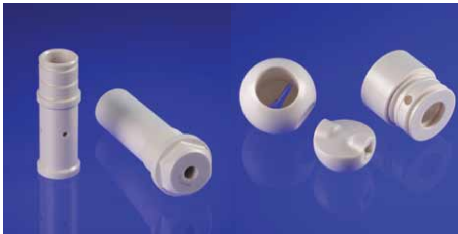
Morgan Technical Ceramics manufactures a variety of advanced ceramic products for many applications including replacement of metal parts.

Like Ceramic Oxide Fabricators, Morgan Advanced Materials Technical Ceramics is heavily invested in enhancing its existing applications—for example, components for severe service valves—and broadening its customer base for those applications. Its business is focused on customized solutions and often develops replacements not for other ceramics, but, rather, metal parts.