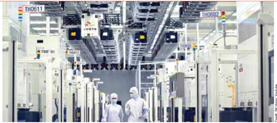
SK Hynix is the second largest manufacturer of memory semiconductor.

“Korean automotive companies themselves are under pressure to improve performance with reasonable prices rather than to reduce the cost,” our panel said. “For fuel efficiency improvement, for example, they are