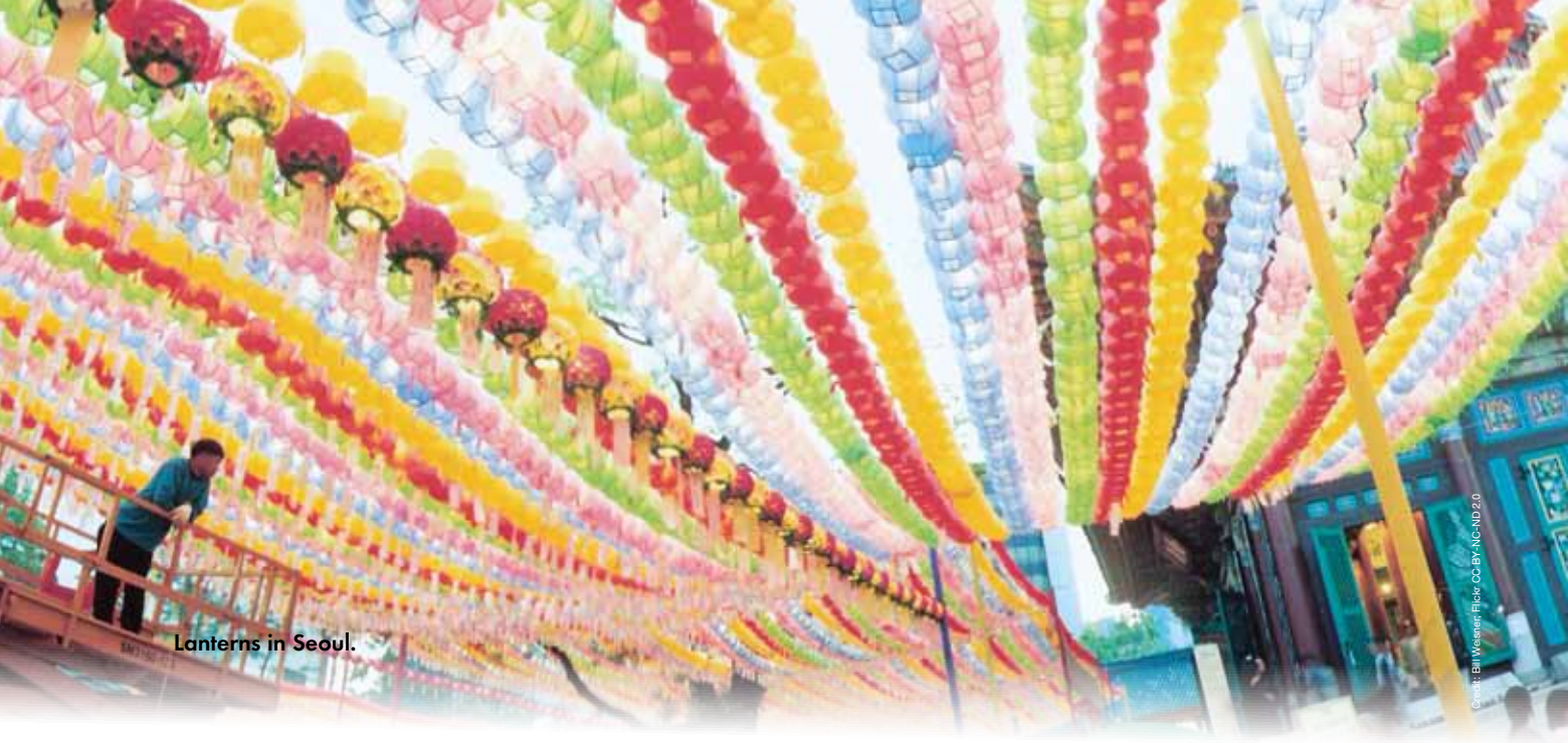
Lanterns in Seoul.