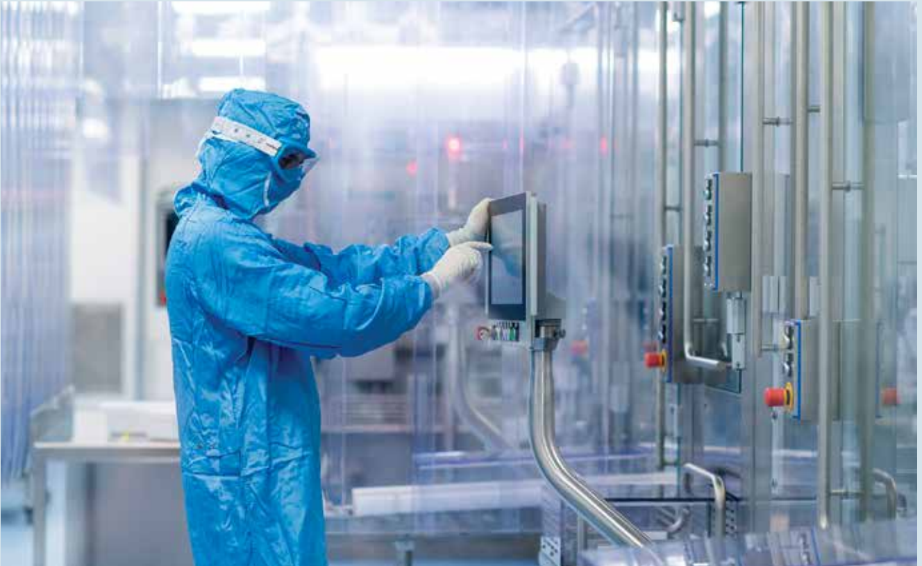
Stevanato Group is expanding production of its EZ Fill vials and syringes in Italy, China, and the U.S.

the end of the summer, students present their project, key findings, and lessons learned during a poster session for Corning's Technology Community.