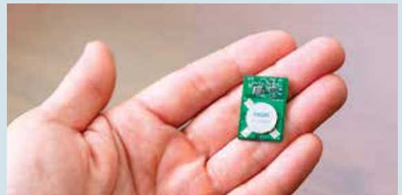
NGK produces ceramic products for the automotive, energy, telecommunications, and other industries.

NGK Insulators, Ltd. will install photovoltaic equipment with a total capacity of 40 MW at its manufacturing sites in Japan, Poland, Thailand, and elsewhere by fiscal year 2025. The renewable energy plan will cut its annual carbon dioxide emissions by 22,000 tons, the company says. NGK plans to achieve net zero CO 2 emissions by 2050. The group is also developing technology for manufacturing ceramics using clean energy sources that do not emit CO 2 , such as hydrogen and ammonia.