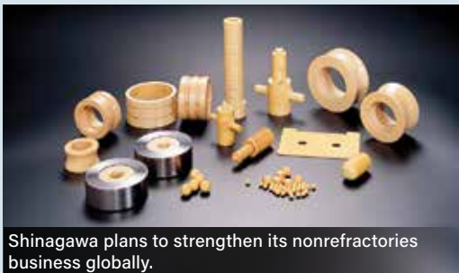
Shinagawa plans to strengthen its nonrefractories business globally.