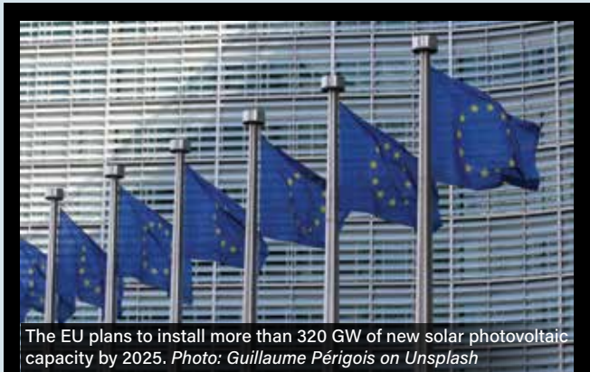
The EU plans to install more than 320 GW of new solar photovoltaic capacity by 2025.