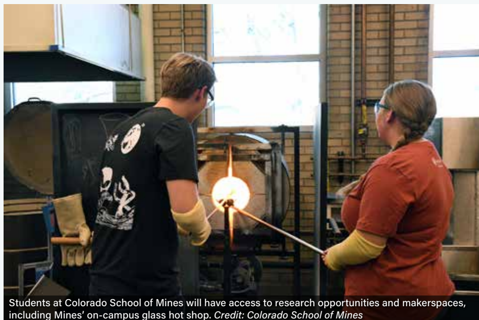
Students at Colorado School of Mines will have access to research opportunities and makerspaces, including Mines' on-campus glass hot shop.