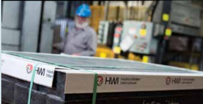
Pittsburgh-based HWI is the largest refractory products and services supplier in North America.

The European Commission launched the European Solar PV Industry Alliance to secure diversification of supplies through more diverse imports and scale up solar photovoltaic manufacturing in the European Union. The Commission says the alliance is an essential component of the REPowerEU plan, which aims to scale up and speed the production of renewable energy in Europe to gain independence from Russian fossil fuels, and make the EU's energy system more resilient.