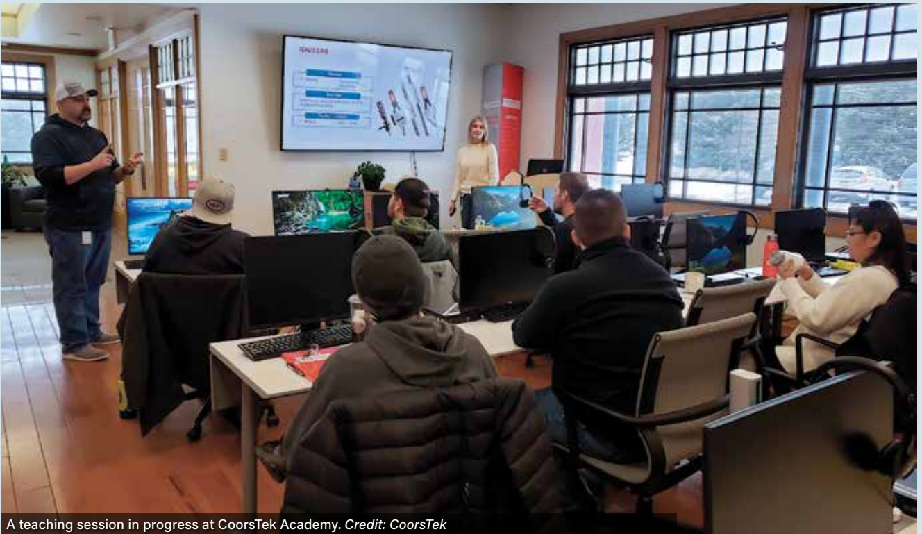
A teaching session in progress at CoorsTek Academy.