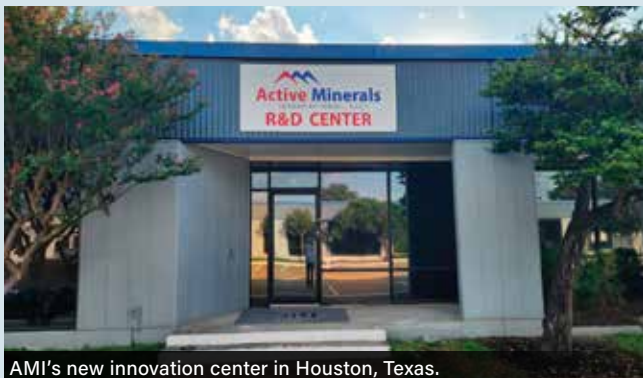
AMI's new innovation center in Houston, Texas.