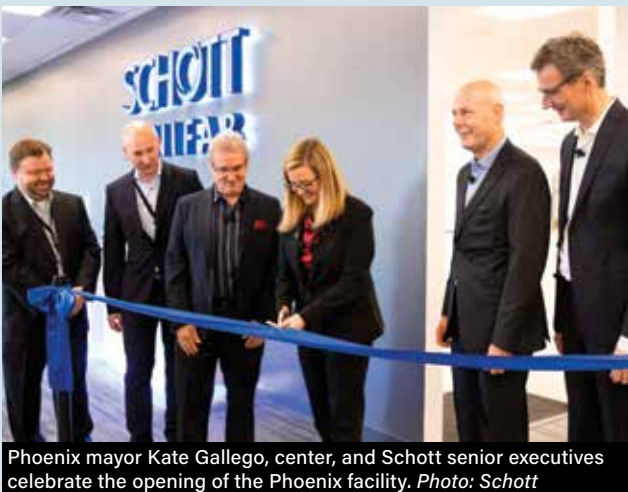
Phoenix mayor Kate Gallego, center, and Schott senior executives celebrate the opening of the Phoenix facility.

Schott opened its first facility in the U.S. to increase capacity to develop and manufacture diagnostics and life sciences products. The multimillion-dollar investment in a 40,000-square-foot facility in Phoenix, Ariz., will focus on production of custom DNA and protein biosensors and other microarrays on glass, semiconductors, and polymer microfluidic consumable devices. The expansion will create 150 new jobs over the next few years.