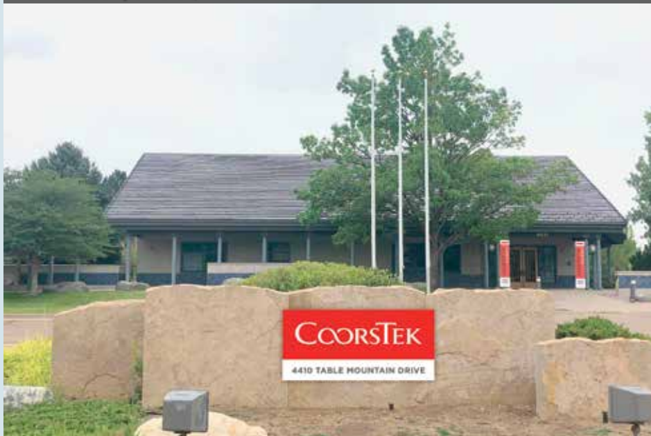
CoorsTek Academy in Golden, Colo.

"They are a little bit blown away," she says. "They love that we are investing that much time in them."