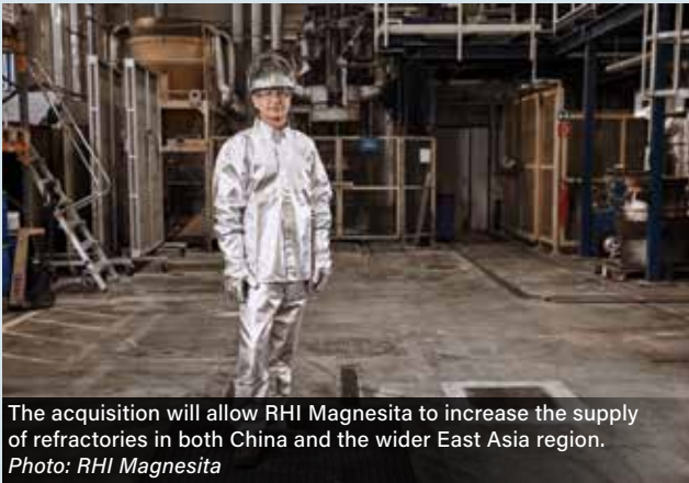
The acquisition will allow RHI Magnesita to increase the supply of refractories in both China and the wider East Asia region.

RHI Magnesita acquired a majority share of Jinan New Emei Industries Co., Ltd., a leading producer of refractories in China. Jinan New Emei produces refractory slide gate plates and systems, nozzles, and mixes for use in steel flow control. It employs more than 1,300 people and is headquartered in Shandong province. RHI Magnesita says it expects to realize substantial synergies from the combination of Jinan New Emei with its existing refractory business in China.