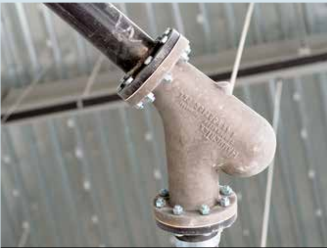
CoorsTek installed Smart Elbow deflection elbows after experiencing failures of ceramic-lined sweep elbows along its eight pneumatic lines conveying highly abrasive alumina.

"I don't think it was communicated clearly how abrasive our materials are," Harm says. "They very quickly started poking holes in the elbows."