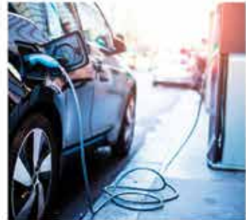
Electrify our World