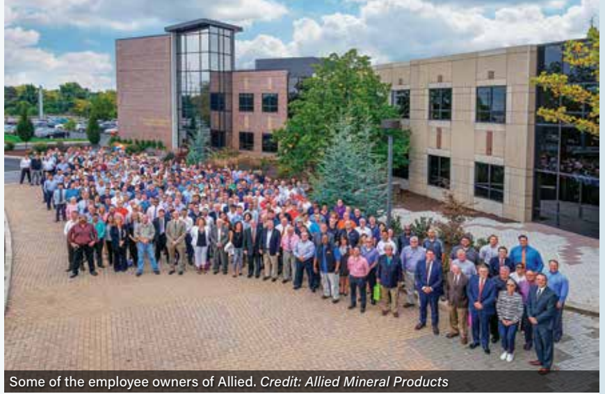
Some of the employee owners of Allied.

Allied employs teams of engineers who work with customers to help determine what their needs are. They work to understand the customers' processes and goals and what the products' performance requirements will be. They then engineer solutions by selecting products from Allied's extensive list or creating advanced ceramic customized solutions that make the best use of an existing product or creating a new one.