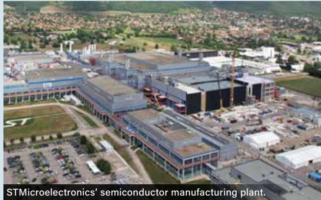
STMicroelectronics' semiconductor manufacturing plant.

STMicroelectronics and GlobalFoundries Inc. signed a memorandum of understanding to create a jointly operated 300-mm semiconductor manufacturing facility adjacent to ST's existing 300-mm facility in Crolles, France. The facility is targeted to operate at full capacity by 2026, with up to 620,000 300-mm wafer per year production. ST and GF say they will receive significant financial support from France for the new facility, which will contribute to the objectives of the European Chips Act, including the goal of Europe reaching 20% of worldwide semiconductor production by 2030.