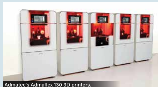
Admatec's Admaflex 130 3D printers.

Salt Lake City-based SINTX develops advanced ceramics for medical and nonmedical applications.