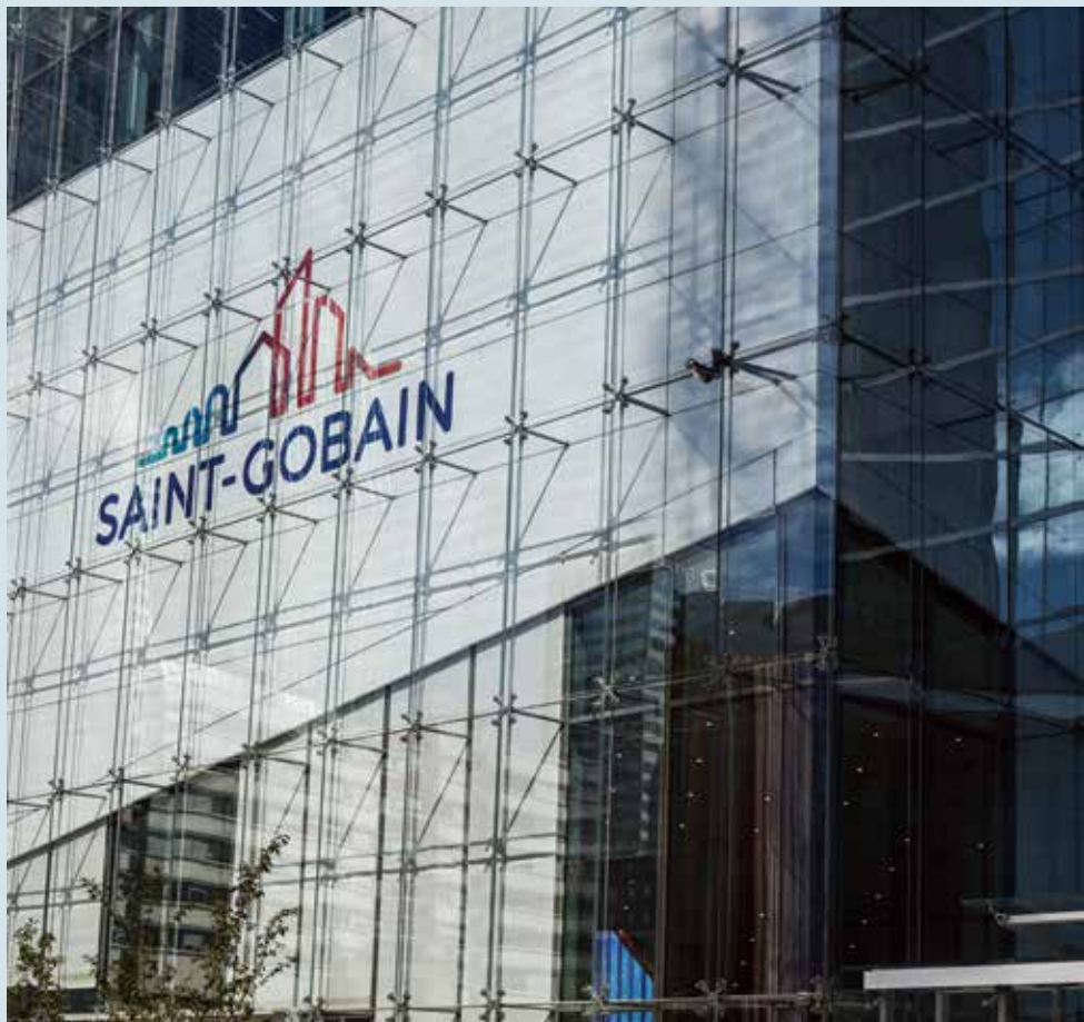
The Saint-Gobain Group is a $44 billion company with 166,000 employees.

A: It's twofold. At Saint-Gobain, one of the major functions of R&D is to have strong relationships with our customers. We learn about