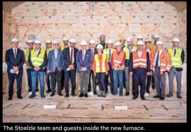
The Stoelzle team and guests inside the new furnace.

Stoelzle Częstochowa rebuilt and expanded its flint furnace so it can now reach a production capacity of 480 tons per day thanks to three more efficient and faster production lines. The total investment amounts to 45 million euros and increases the efficiency of the melting output by 45%. With the investment at the Polish site, the company says it reached a milestone in its long-term growth strategy. It opened a logistics center in 2021 and installed a high-speed spraying line in March 2022.