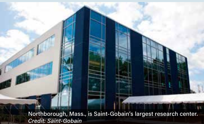
Northborough, Mass., is Saint-Gobain's largest research center.