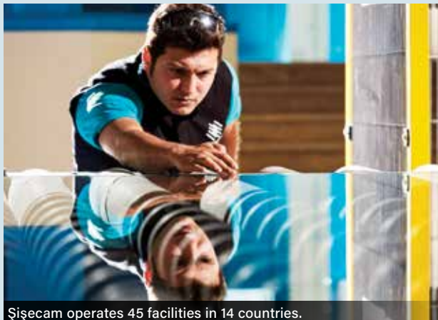
Şişecam operates 45 facilities in 14 countries.

Şişecam plans to invest in a patterned glass furnace with a capacity of 600 tons per day and energy glass processing lines with a capacity of 20 million square meters per year at its facility in Mersin, Turkey. Şişecam currently operates eight flat-glass lines and one patterned-glass line at four locations in Turkey. With the latest investment, Şişecam says it aims to be one of the main suppliers in the renewable energy sector globally. Once it reaches full capacity, the new furnace is expected to generate annual sales revenue of 120 million euros.