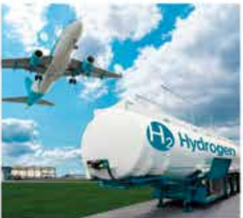
Develop a Hydrogen Economy