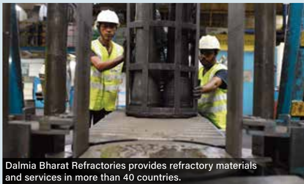
Dalmia Bharat Refractories provides refractory materials and services in more than 40 countries.