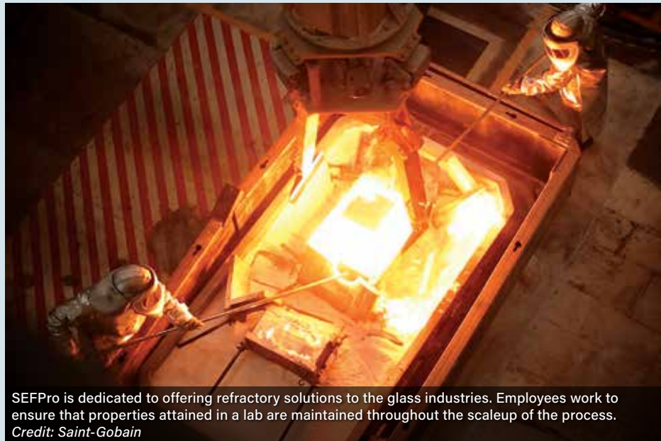
SEFPro is dedicated to offering refractory solutions to the glass industries. Employees work to ensure that properties attained in a lab are maintained throughout the scaleup of the process.

A: There is a lot of potential for using sensors and nondestructive testing techniques to help our customers monitor their furnaces better. We have a complete suite of services where we can help monitor gas emissions to help them get a longer life out of their furnace or maybe diagnose issues or improve efficiencies and detect if there are any temperature leaks. The current trends are leading us to help customers get more and more lifetime out of their furnaces, and help them adapt to environmental regulations. ▽